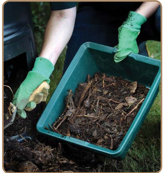
Gardening gloves should always be worn when working with compost.

While steps have been taken to ensure its accuracy, WRAP cannot accept responsibility or be held liable to any person for any loss or damage arising out of or in connection with this information being inaccurate, incomplete or misleading. This material is copyrighted. It may be reproduced free of charge subject to the material being accurate and not used in a misleading context. The source of the material must be identified and the copyright status acknowledged. This material must not be used to endorse or used to suggest WRAP's endorsement of a commercial product or service. For more detail, please refer to our Terms & Conditions on our website: www.wrap.org.uk .