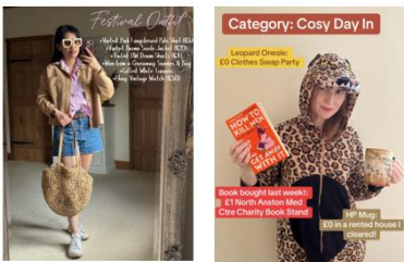
Festival Fashion Cosy Day In